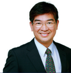
The Hon Sin Chung-kai, SBS, JP Legislative Councillor