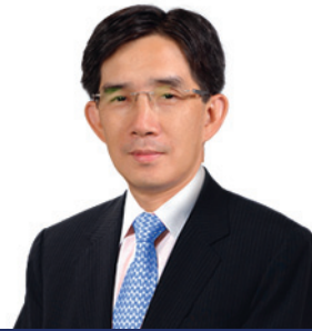
Philip Yung, JP (Deputy Chairman)

Commissioner for Tourism Commerce and Economic Development Bureau The Government of the Hong Kong SAR