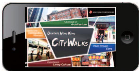
“DISCOVER HONG KONG • CITY WALKS” MOBILE APPLICATION 「香港·都會漫步遊」手機應用程式